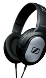
HD 201 Enclosed headphones