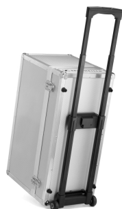
GZR 2020 Trolley frame