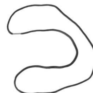
GP 3000-L Lanyard