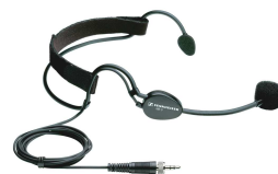
AVL-618 Headband microphone