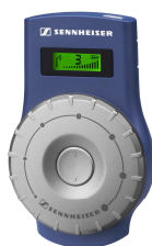
EK 2020-D Bodypack receiver