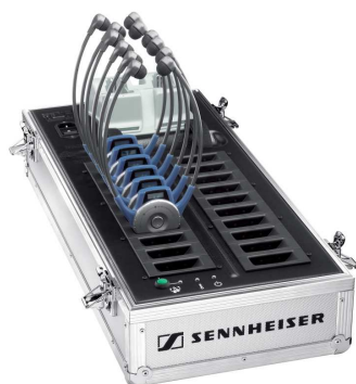
EZL 2020-D Charger/storage case 20 receivers and 2 transmitters