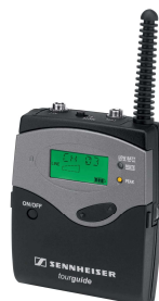
SK 2020-D Bodypack transmitter