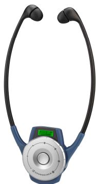
HDE 2020-D Stethoset receiver