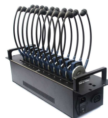
L 2020-10L 10 way receiver charger