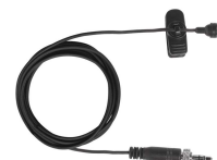
ME 4 Lapel microphone