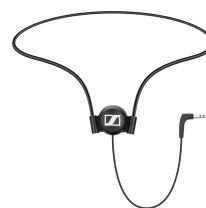
EZT 3012 Neck induction loop