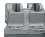
L 2015 2 way transmitter charger