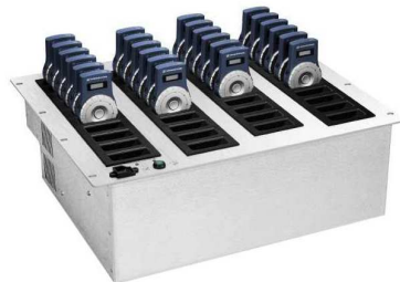
L 2021 40 40 way receiver charger